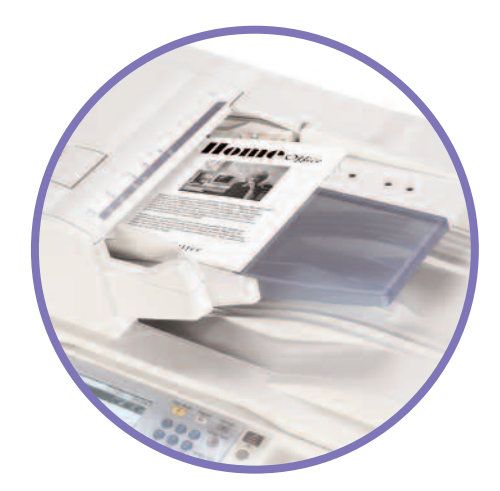
The highly reliable, single-pass document feeder is capable of scanning up to 75-images-per-minute.

Rely on the Ricoh Aficio MP 6000/MP 7000/ MP 8000 to create a variety of attractive, professionally finished documents.